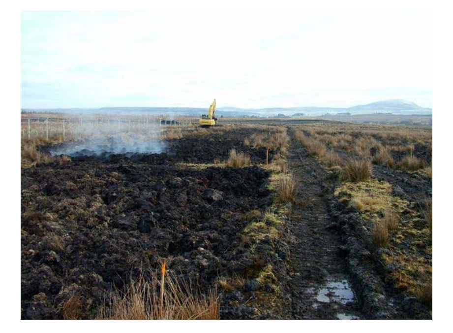
Plate 3. Dalquhandy cultivation site - note steam from the warm compost

The cultivation of the ground at Dalquhandy was easier for the machine and it coped well on site. The only problem encountered was during the spreading and mixing of the compost when the excavator was sitting on the previously treated area and on occasions started to sink in the soft ground. In operational conditions this would have been overcome by the machine working to one side from uncultivated ground.